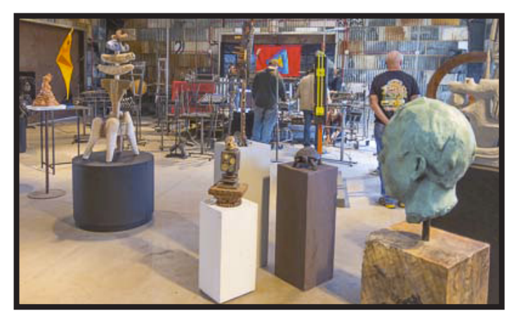
This is one of the venues for the Tucson Sculpture Festival. The building had a lot of Steampunk art design elements.