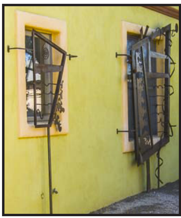
Window Security Grates