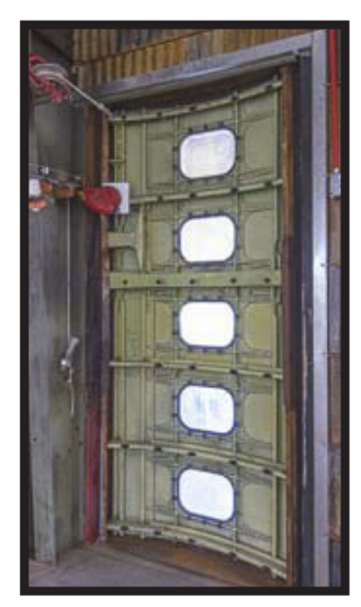
This is the inside of an airplane fuselage that is used as an entry door.