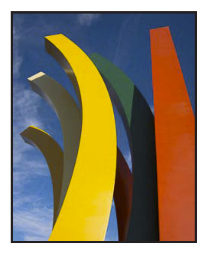
Metal Arts Village http://www.metalartsvillage.com

The Metal Arts Village, (a collection of metal artist's studios and shops), is always a great place to visit and take a walk through their public sculpture garden.