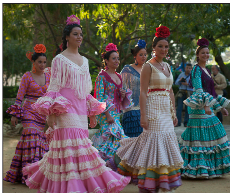
Our Welcome To Ronda Fashion Show...