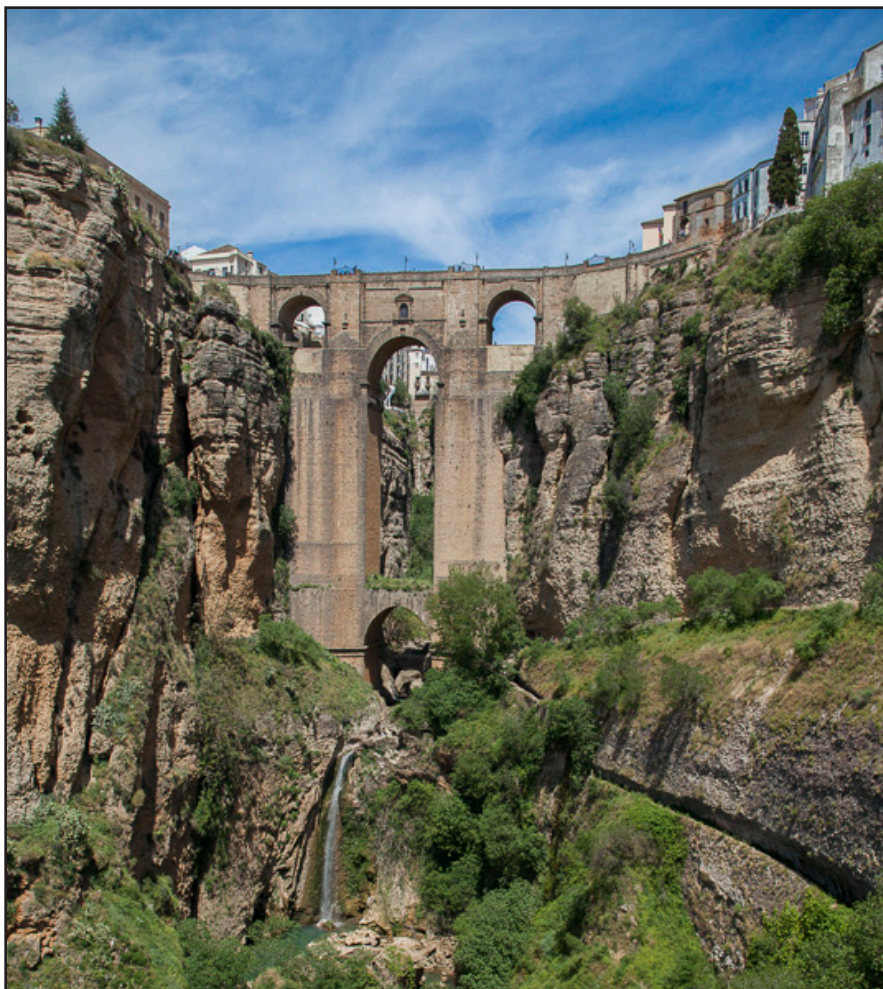
The Famous View Of Ronda....