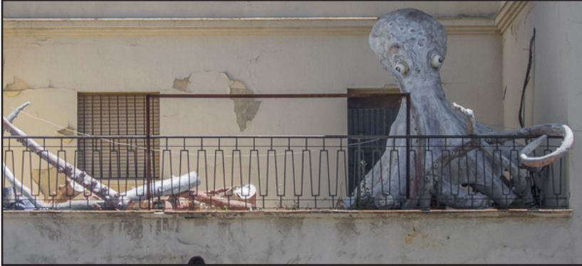
An octopus arm loss crisis on a Malaga balcony....