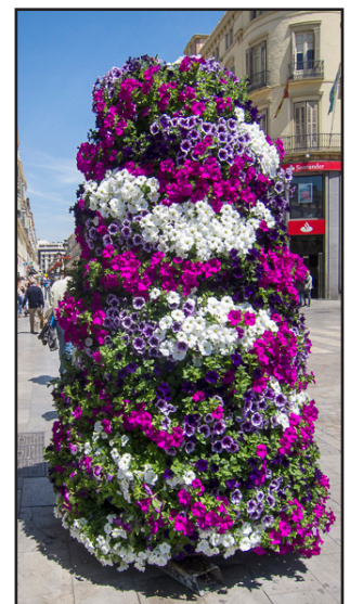
Poulsbo's flower theme on steroids...