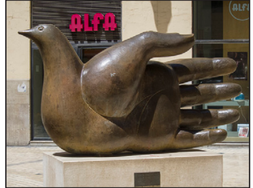
Malaga Public Art