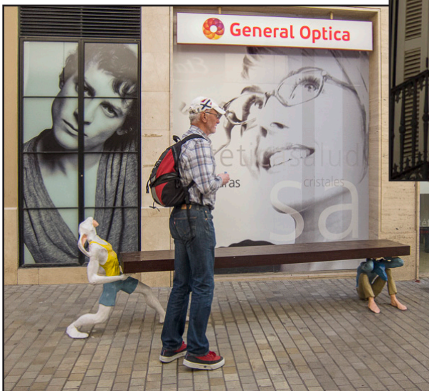
Malaga characters providing a resting spot for us weary travelers.