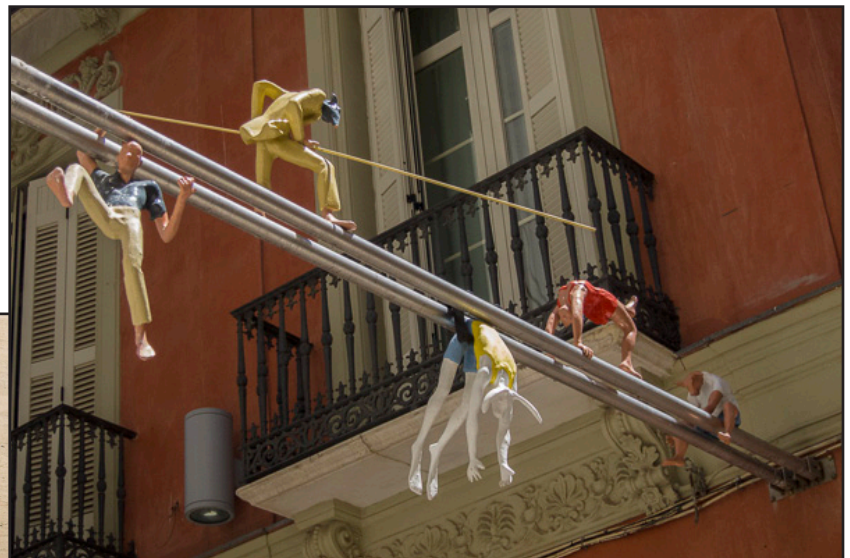
More Malaga characters providing chaos and entertainment above.