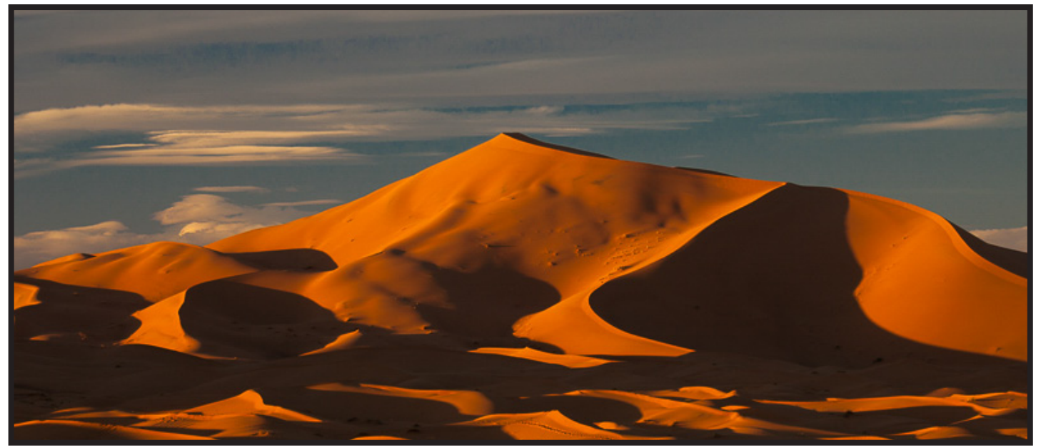
After Fes we headed for the Sahara....

Morocco (November, 2013) Part III - Fes To The Sahara