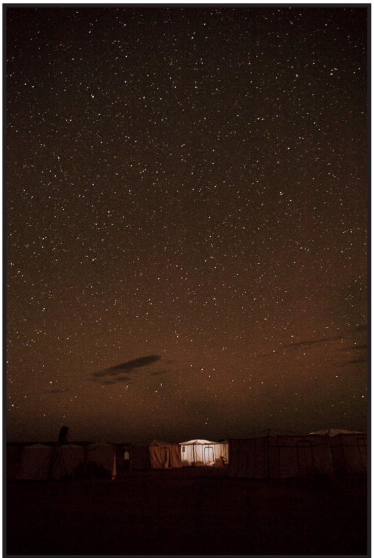
Our tent and the Sahara night sky...

We were just a few miles from Algeria and I was curious if these semi-nomads had to be aware of where the border was. They said it was of no matter to them and they traversed it at will.