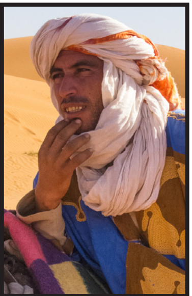
Our guide for the camel ride through the big sandy parking lot...