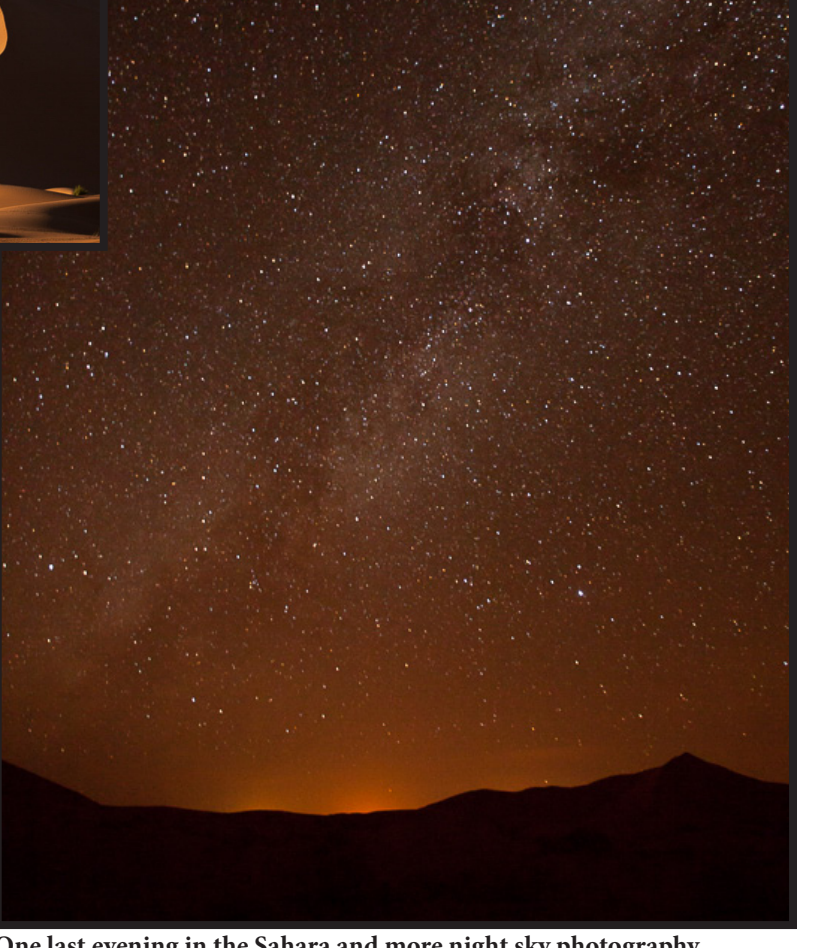
One last evening in the Sahara and more night sky photography...

The glow over the dune ridge is from light at a settlement and small town called Erfoud on the other side of the dunes to the northwest.