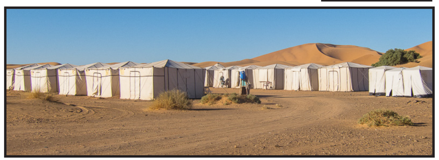
After our camel ride, we inserted ourselves back into the 4x4 vehicles and continued our travels into the Sahara and to our tent camp.