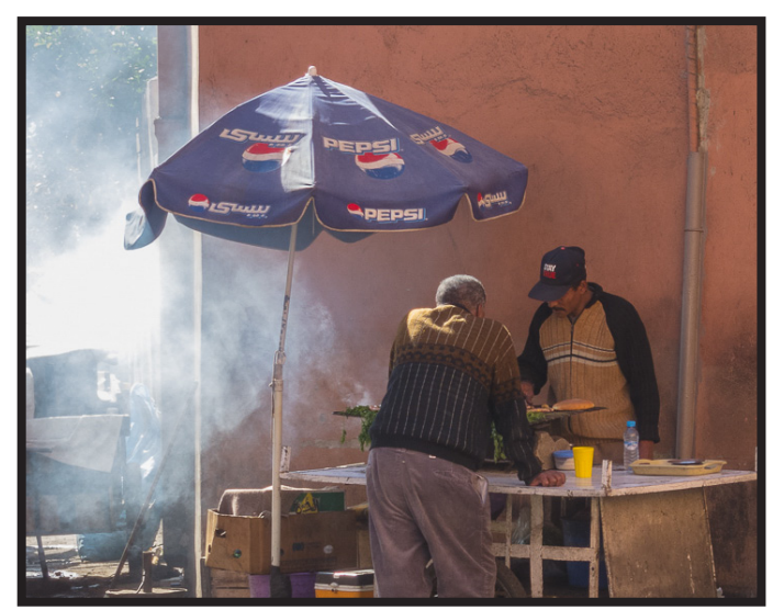
The market streets had plenty of interesting things to photograph, but I don't feel I got very good results... so... another trip to Morocco would certainly be in order.