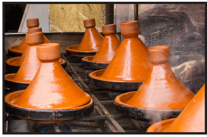
Tajine in BarBeQue...

This is how tajine is cooked at the pedestrian level, this particular kitchen is out on the street... The designer tajine cookers are left to the more affluent and more upscale restaurants.