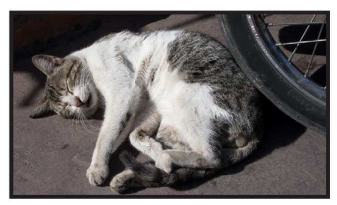
And so, as we ended our trip, a little warm sun came out and I assumed this position too...