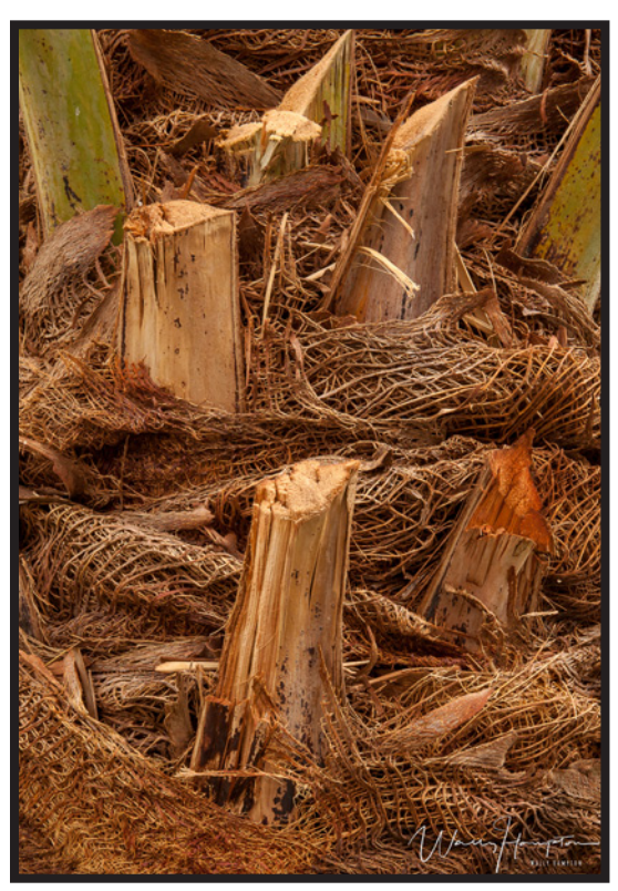
Detail Of A Real Palm Tree...