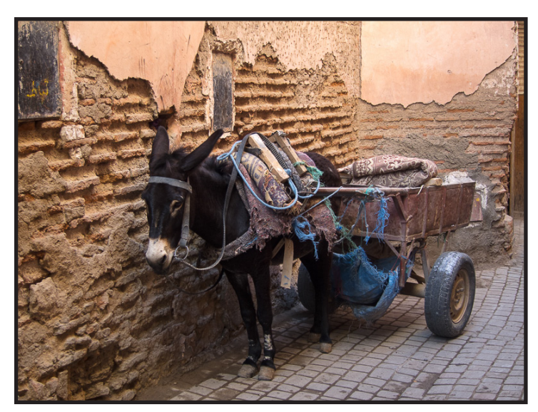
I must have been getting as tired as this old donkey leaning against the wall seems to be...