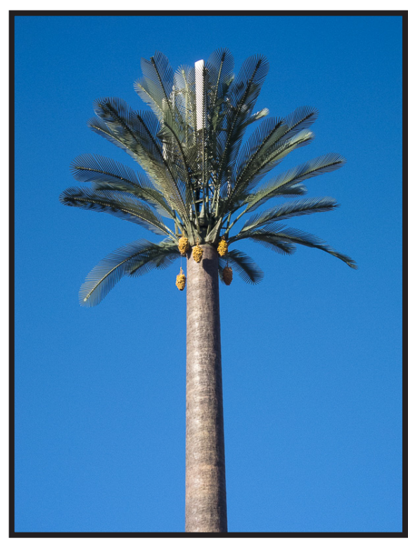
Merrakesh Date Palm Cell Tree...

There is more about this place from this link to Wikipedia: http://en.wikipedia.org/wiki/A%C3%AFt_Benhaddou