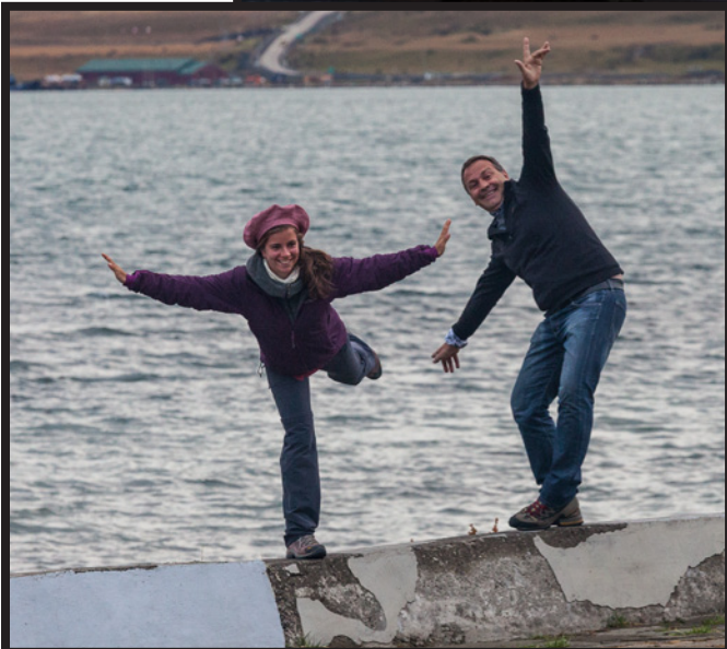
Our guides making do without the poles...