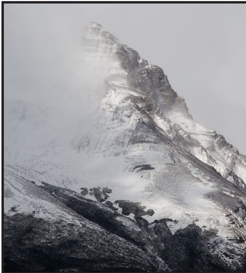
As well as the glacier itself, the clouds rolling in and out of the peaks above the glacier provided some great opportunities for photographs too.