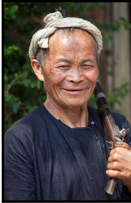
These fellows are allowed to have rifles, unusual in China. They are a small caliber black powder kind of rifle used for small game, not too much of a revolutionary threat to the current government.

This young man kept a pretty close eye on me while I walked through his village.