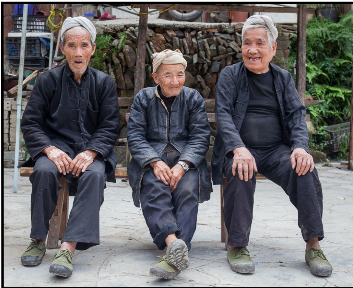
A village “Situation Room”. These guys all shop at the same clothing and shoe store