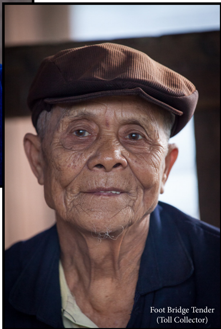
Foot Bridge Tender (Toll Collector)