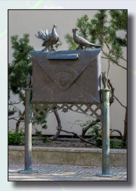
Airmail By Pigeon Drop Box