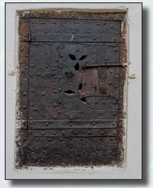
And a seriously big door with serious wear marks!